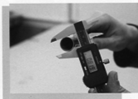
BUTT DIAMETER VERIFICATION